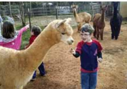
Adventures on the North GA Farm Trail