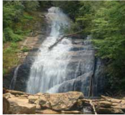
Helton Creek Falls

Immerse yourself in mountain culture by visiting the historic Byron Herbert Reece Farm & Heritage Center or the internationally renowned Margarita Morgan Miniature House collection at the Historic Courthouse on the Square. Be sure to check our calendar for the amazing festivals that take place throughout the year, including the Blairsville Arts, Crafts and Music Festival, The Scottish Festival, Sorghum Festival and more!