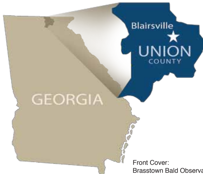
Front Cover: Brasstown Bald Observatory