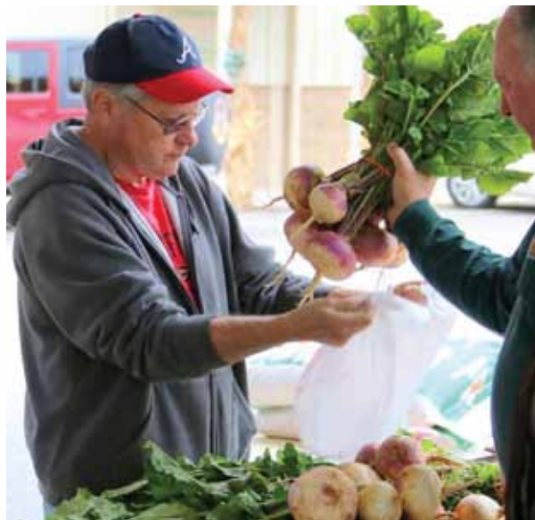
Farmer's Market