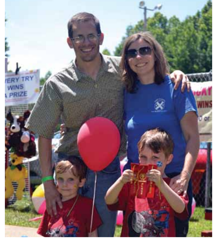
Family fun at one of our area festivals